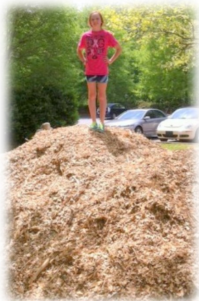
Yes, all five piles were this big!