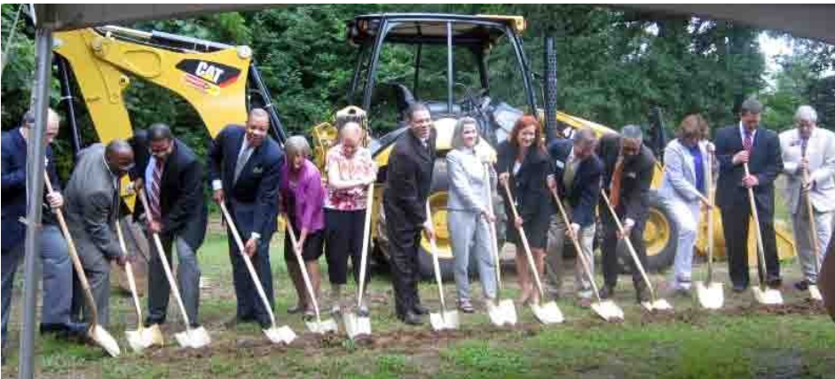
The East Roswell Library ground-breaking, pictured here, occurred on August 1st.

Proceeds from the Aug. 16th--18th book sale, including new and renewed Friends memberships, equaled $4,311! Thanks to everyone who took part!